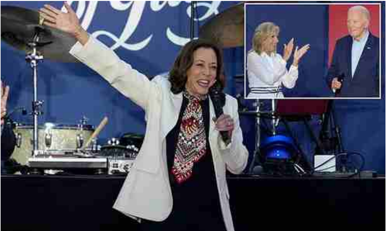
Giddy Kamala Harris calls Biden 'vice president' at July 4 event 31.3k viewing now