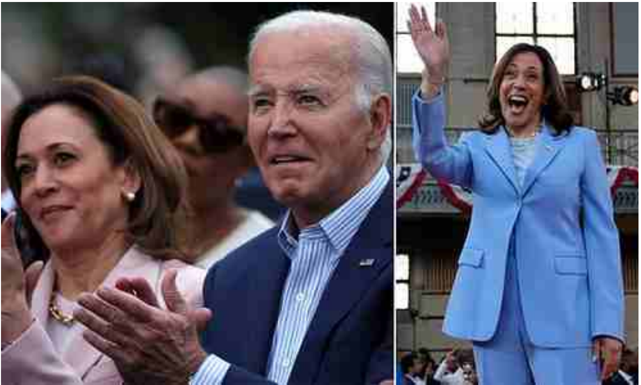
Why Democrats fear Kamala Harris replacing Biden is now 'inevitable' 5.3k viewing now